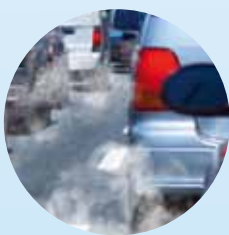
CO 2 control